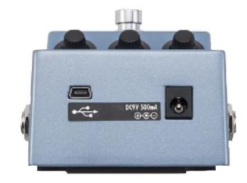
(Yes, these are ALL MIDI Jacks!)

In order to connect your device or devices to the DMC.micro you will need the correct cabling! The DMC.micro may control up to THREE MIDI devices in any combination. For example, three devices chained to the 5-pin port, or two 1/4" devices and one USB.